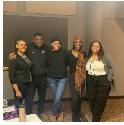
The panelists pose for a picture with two members of Shades of Pearl, an organization at the university.