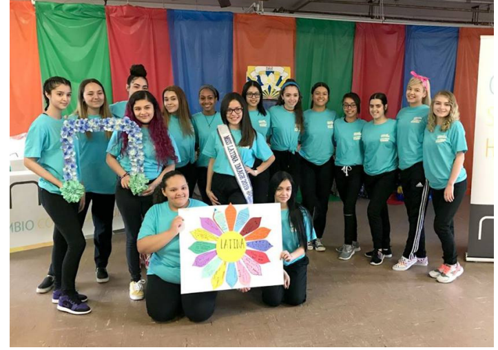
Some local students participate in a program hosted by Cleveland Rape Crisis Center's Hogar Consuelo program.