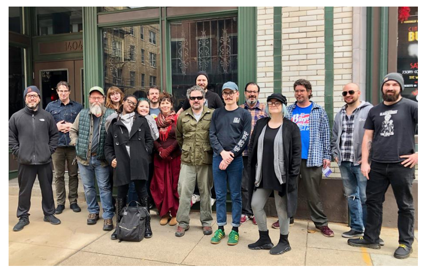
Some of the awesome bar staff trained by Women Helping Women for the "It's On Us" bar training.